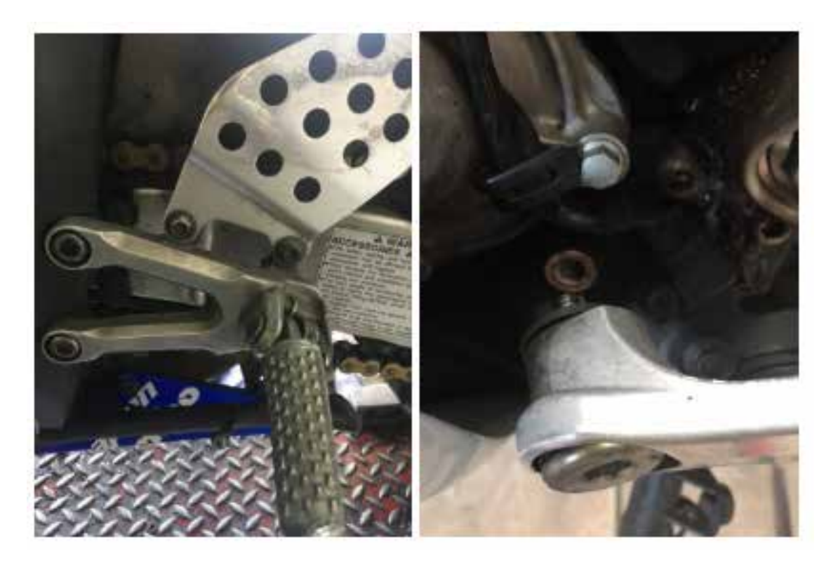
2. Re-install the new footpeg bracket with the original screws, and the heel protector with the screws supplied with our kit.

1. Dismantle the foot rest bracket fixed on the frame. Unscrew the gear shift from the engine and on the gear shift rod (Be careful not to lose the washer).