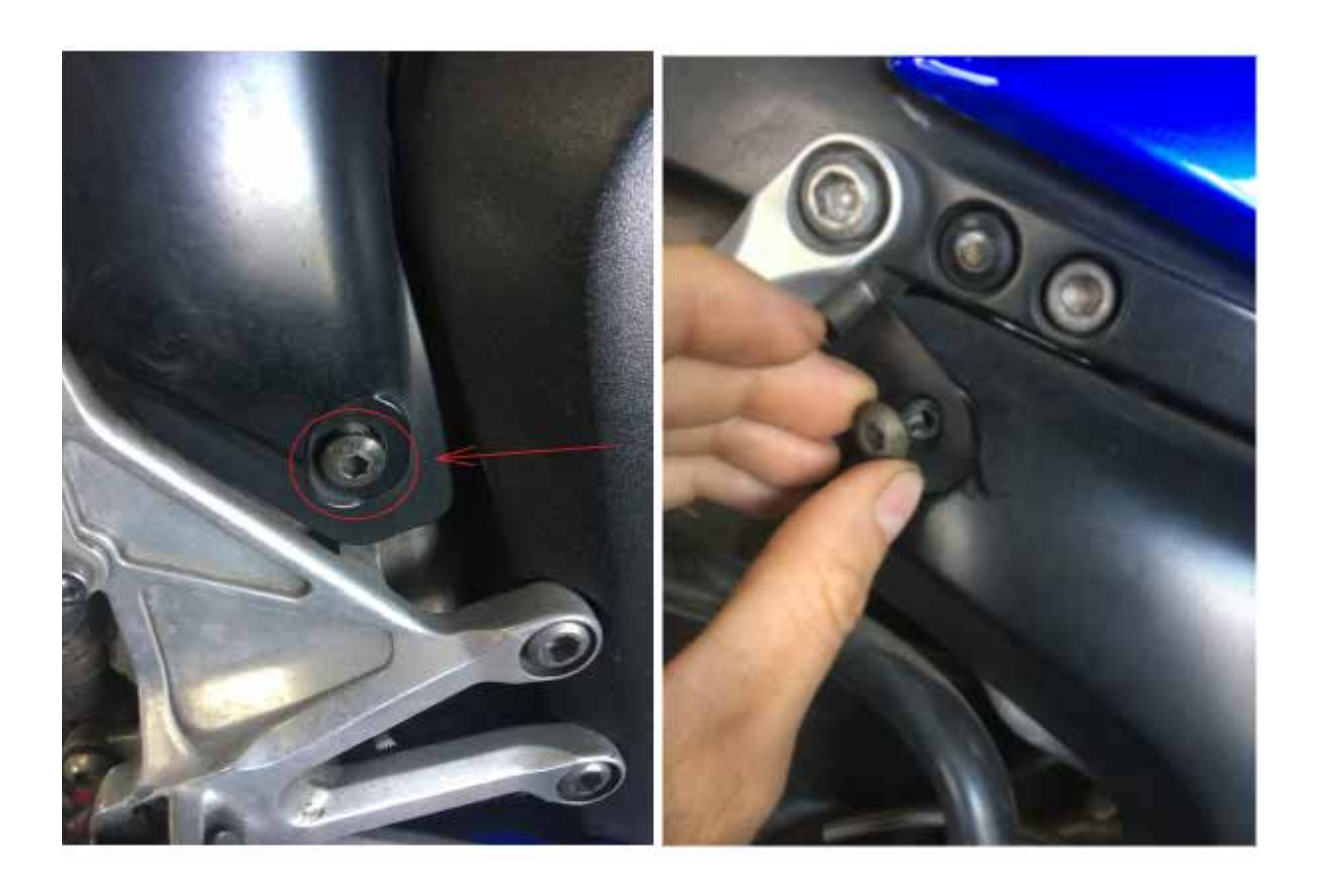
2. Remove the Master Cylinder mounting screws. And dismantle the original footrest bracket by unscrewing the screws fixing it to the frame.

1. Remove the 2 screws of the heat shield, then unclip it