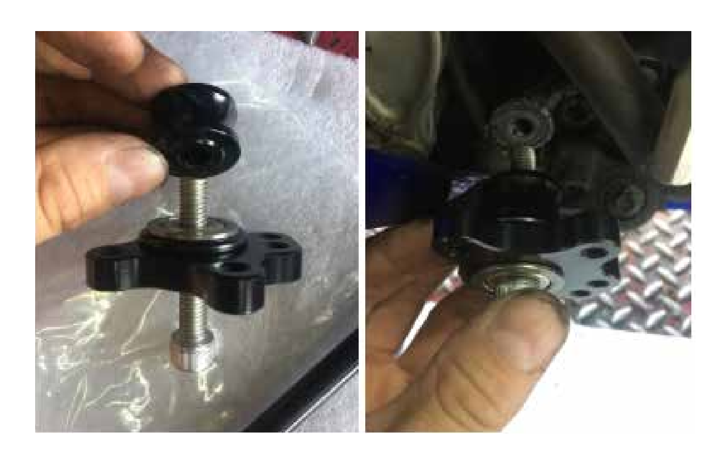
4. Attach the new ball joint to the original gear shift rod. Then on the pivot.